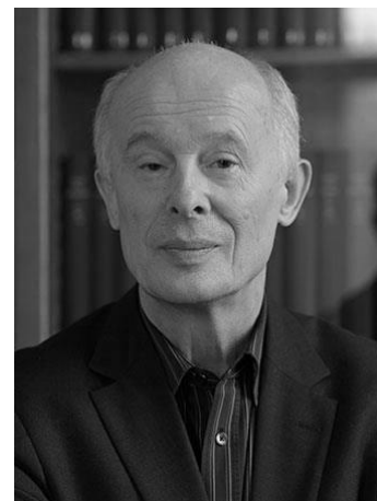
Prof. Dr. Dr. h.c. Hans Joachim Schellnhuber

Scientific Director at the Institute for Advanced Sustainability Studies Potsdam